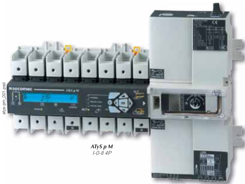
ATyS p M I-O-II 4P